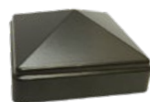
3.5" Post Cap