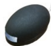
Oval Post Sconce