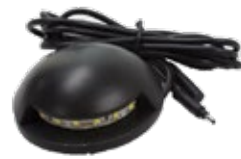
Round Post Sconce